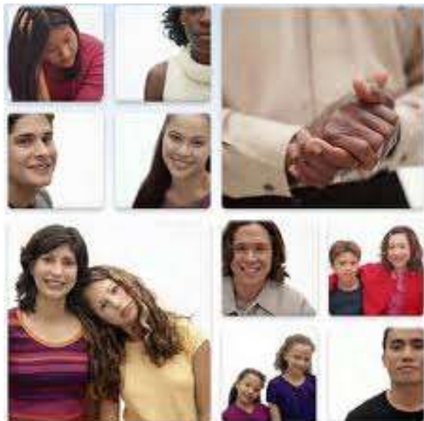
Report to the Community