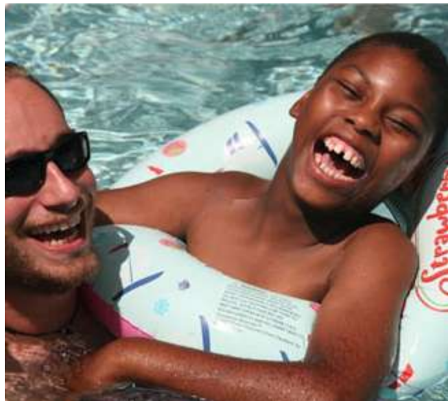
Report to the Community