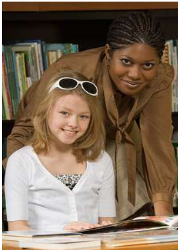
Report to the Community